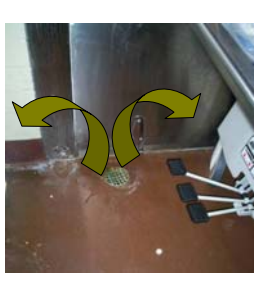
Floor drain hidden by furniture