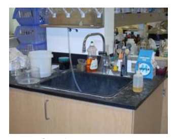
Sink frequently used No odor problems here

As laboratories are usually negative in pressure, odors can come into the room very easily.